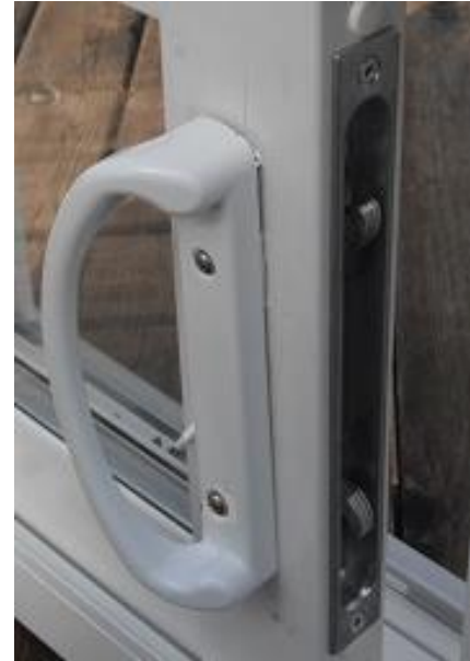
Door with Existing Mortise Latch before Morty Installation

This type of latch takes up a bit of space and so is typically found only on sliders with wider stiles (the vertical side frame of the moving door panel) such as those made of vinyl, wood or fiberglass. Narrow-styled aluminum sliders rarely have mortised latches.